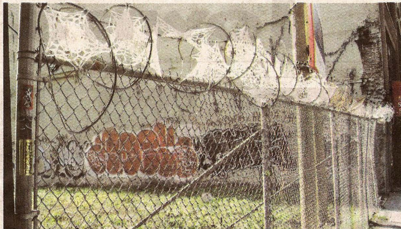
"Invasive Crochet," an exhibit by Crystal Gregory

For the second time, the month-long Art in Odd Places festival (AiOP) is running through the entire length of the street from the Highline to the East River. Some of the exhibits are ongoing, while others that are performance-based will occupy certain blocks on different days through October 26. One of the projects, entitled, "U-Brick-Quitous," is a walking tour around Stuyvesant Town, with a focus on the bricks and construction that made up the complex. There will also be a modern day bread line, crochet statues, a public napping exhibit and poetry verses being projected into the small fountain at Union Square Park. For a full schedule of AiOP exhibits, visit artinoddplaces.org .